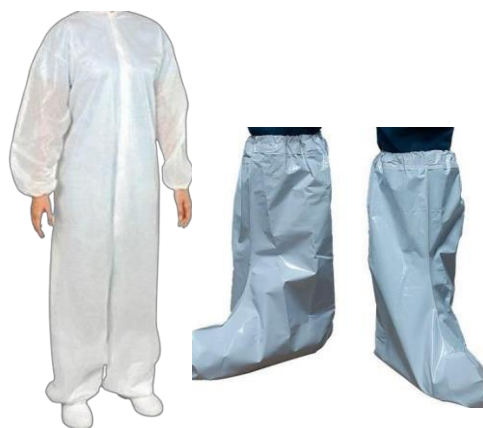
Figure 2: Non-woven clothing and disposable plastic boots commonly used on field visits.

For visits to slaughterhouses: Upon arriving at the production unit, visitors will receive a new change of clothes and shoes (clothes for internal visits), as well as ear protectors, masks and gloves, if necessary.