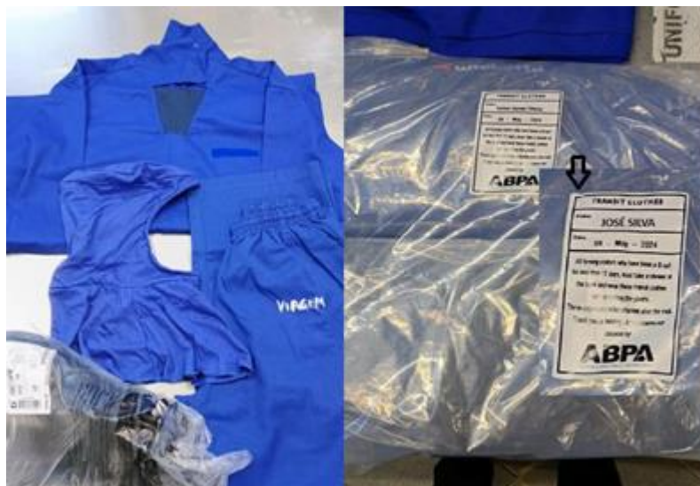
Figure 1. Set of clothes and footwear - must be provided according to the visitor's size informed prior to the visit.

The unit that will receive the visitors is responsible for providing transit clothes ( Figure 1 ), according to the sizes informed on the biosecurity forms previously sent to these teams. Such clothes must be sent to the hotel where the visitors will be staying, properly packed in individual plastic bags, and identified with the names of the respective visitors.